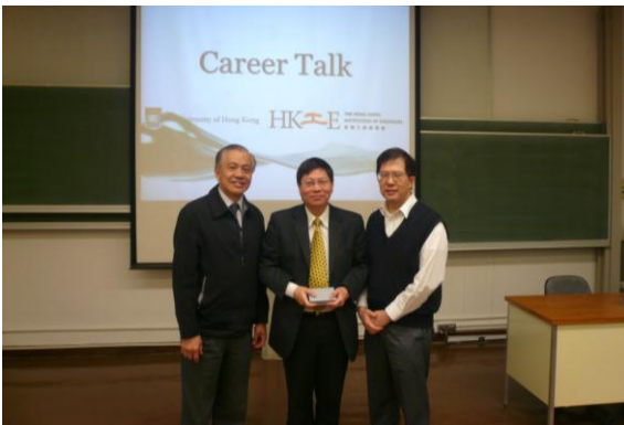
Career Talk at HKU (1 Mar 2013)