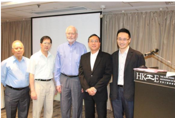
Technical seminar on Problem Solving – A Different Way of Thinking (7 Nov 2012)