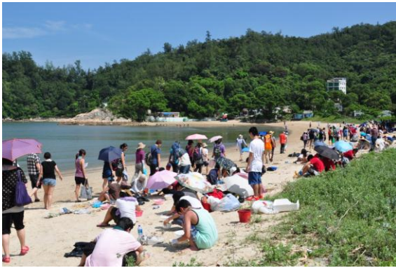
Beach Cleanup Action (19 Aug 2012)