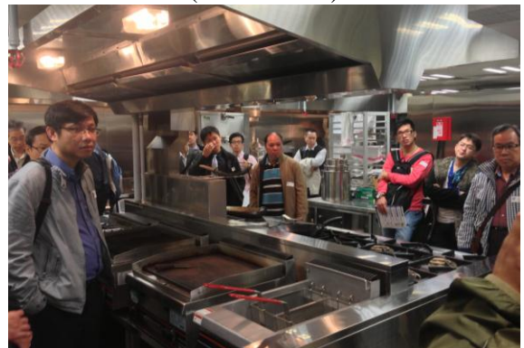
Certification Course on Commercial Kitchen Design & Licensing (4 – 20 Mar 2013)