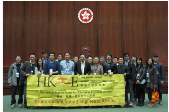
Visit to Legislative Council Complex (23 Feb 2013)