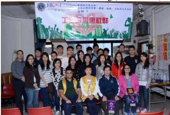
Community Service to Elderly Home (26 Jan 2013)