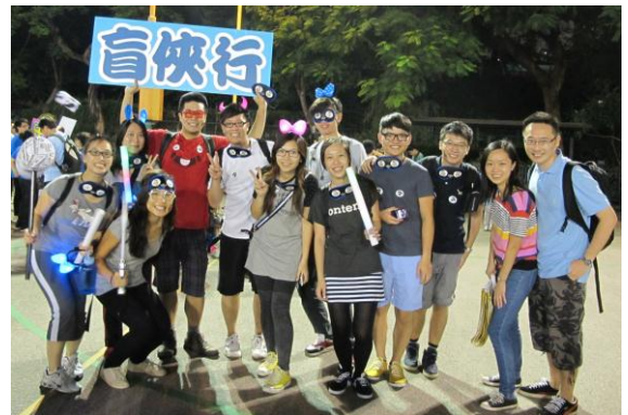
Orbis Moonwalker (10 Nov 2012)